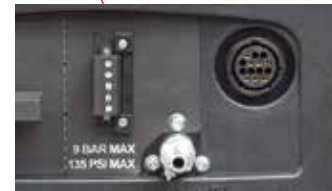
Serial interface port (RS-485) CPC port