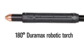
180° Duramax robotic torch