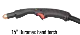
15° Duramax hand torch

The Duramax torch series includes torches for every application need, from gouging to robotic to extended reach.