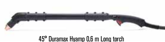
45° Duramax Hyamp 0,6 m Long torch