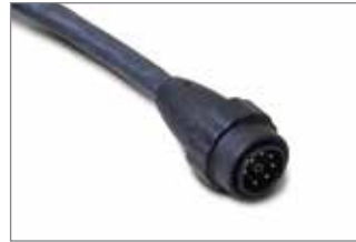
Handheld torch lead with quick disconnect