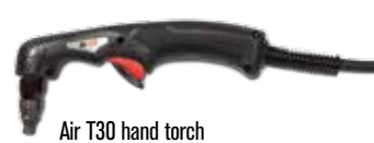
Air T30 hand torch