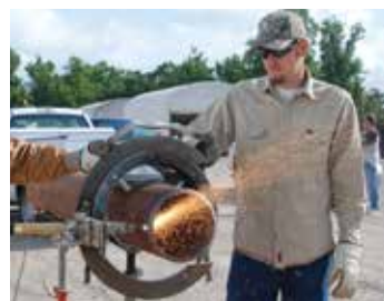
Portable mechanized cutting