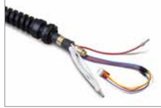
Handheld or mechanized torch lead without quick disconnect for Powermax600 CE systems