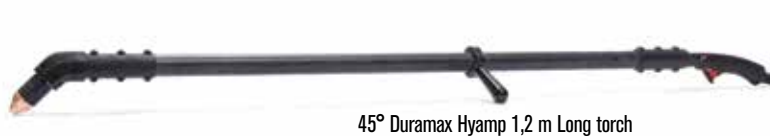
45° Duramax Hyamp 1,2 m Long torch