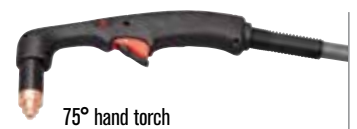
75° hand torch

*Pierce rating for handheld use or with automatic torch height control