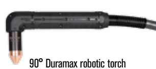
90° Duramax robotic torch