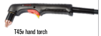
T45v hand torch