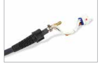
Easy Torch Removal (ETR) connection