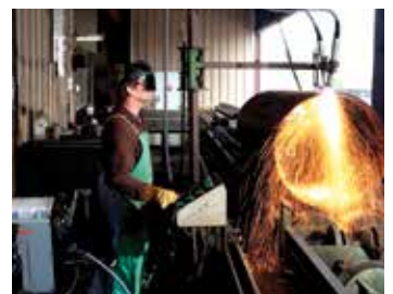
In the factory