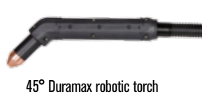
45° Duramax robotic torch