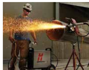
In the field