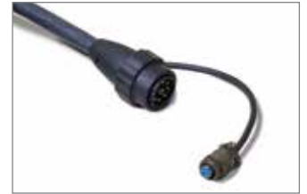
Mechanized torch lead with quick disconnect