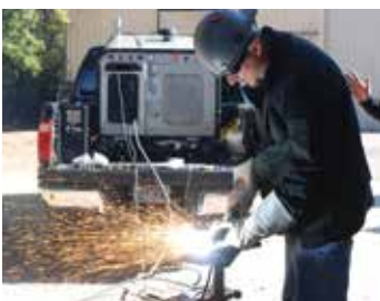
Handheld cutting in the field