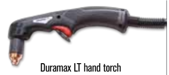
Duramax LT hand torch

Watch a Powermax® system demonstration at www.hypertherm.com/powermax/videos/